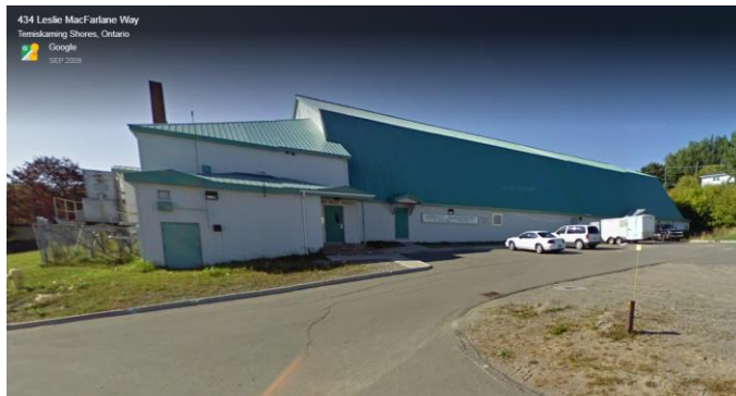
Cobalt-Haileybury Curling Club 434 Leslie MacFarlane Way HAILEYBURY, Ontario

One of the agenda items for the General Membership Meeting is to discuss and vote on a potential local dues increase.